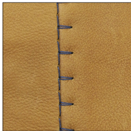
DECOR STITCH: TYPE "B"